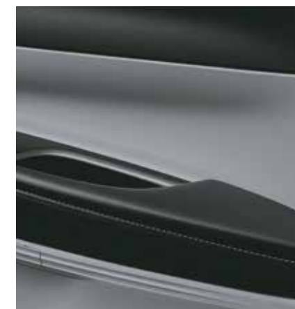
Door armrest covering (artificial leather)