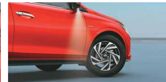
Puddle lamps with welcome function

Other features: Chrome outside door handles | Turn indicators on outside mirrors Painted black finish side sill garnish with i20 branding | Shark fin antenna