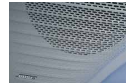
Bose premium 7 speaker system

Other features: 60+ Bluelink connected features | Multi-language UI support (12 nos.) | OTA updates for infotainment and map Home to car (H2C) with Alexa (English & Hindi) | Cruise control | Rear AC vents | Multi phone bluetooth connectivity