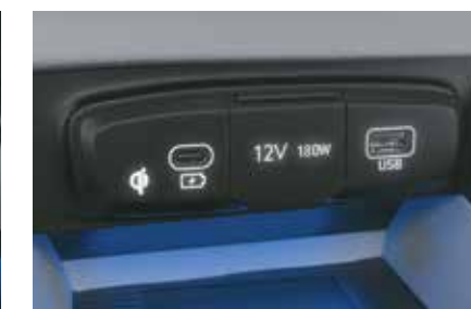
Fast USB charging (Type C)