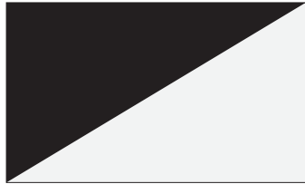
Atlas white with abyss black roof