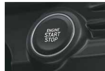
Push button start/stop