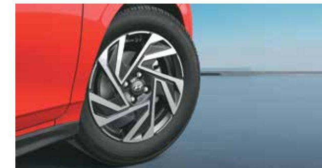
R16 (D=405.6 mm) diamond cut alloy wheels