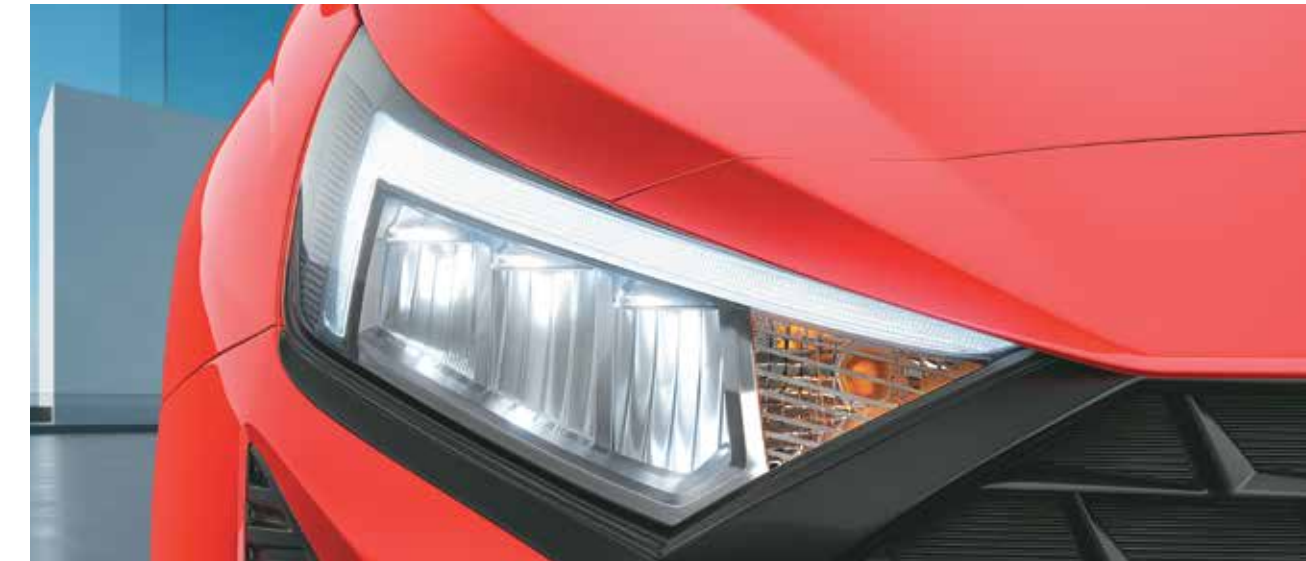
LED headlamps with signature DRLs

The new Hyundai i20 has it all. A sensuous sporty design, a majestic new grille and lights that are a showstopper. Turn heads as you whizz by on those alloy wheels and make an impression with the chrome lines. It's simply stunning from tip to toe.