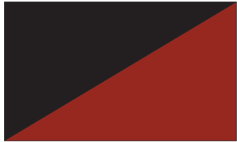
Fiery red with abyss black roof