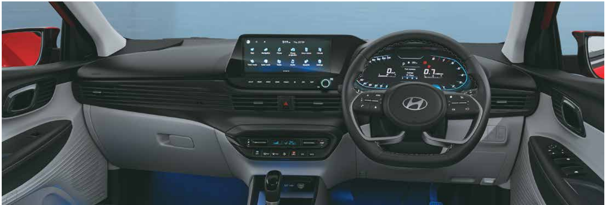
Dual tone black & grey interiors