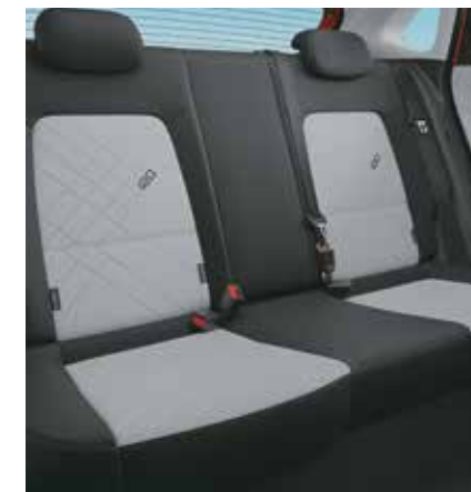
Spacious interiors with ample headroom, legroom and shoulder room