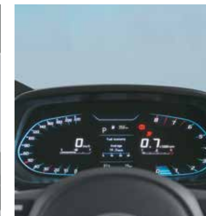
Digital cluster with TFT multi information display

Other features: Superior leg room and thigh support | Sliding front armrest | Leather wrapped steering wheel and gear knob | Metal finish inside door handles