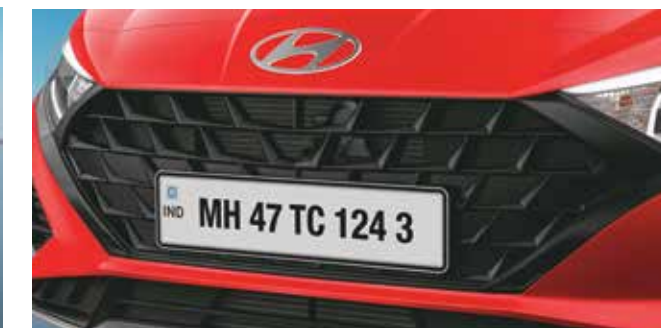
Parametric jewel pattern grille