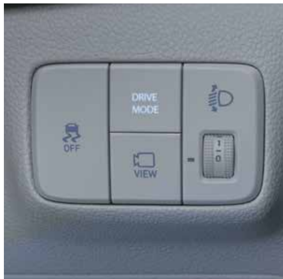
Drive mode select