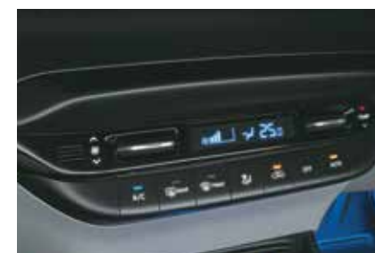
Fully automatic temperature control (FATC)