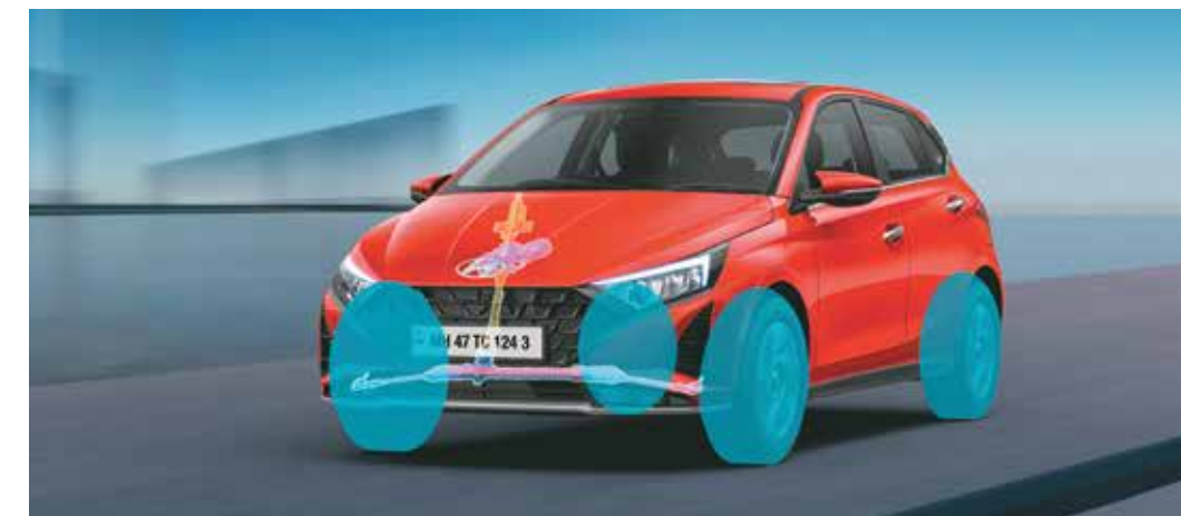
Electronic stability control (ESC) with vehicle stability management (VSM)