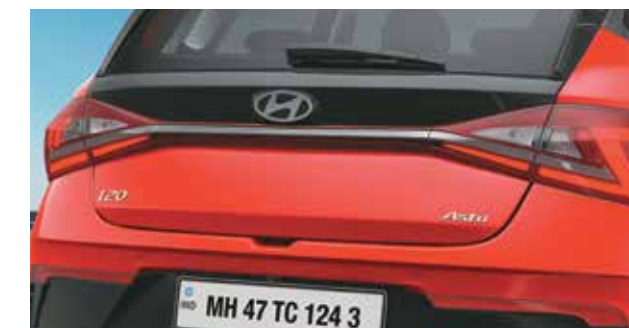
Stylish Z-shaped LED tail lamps