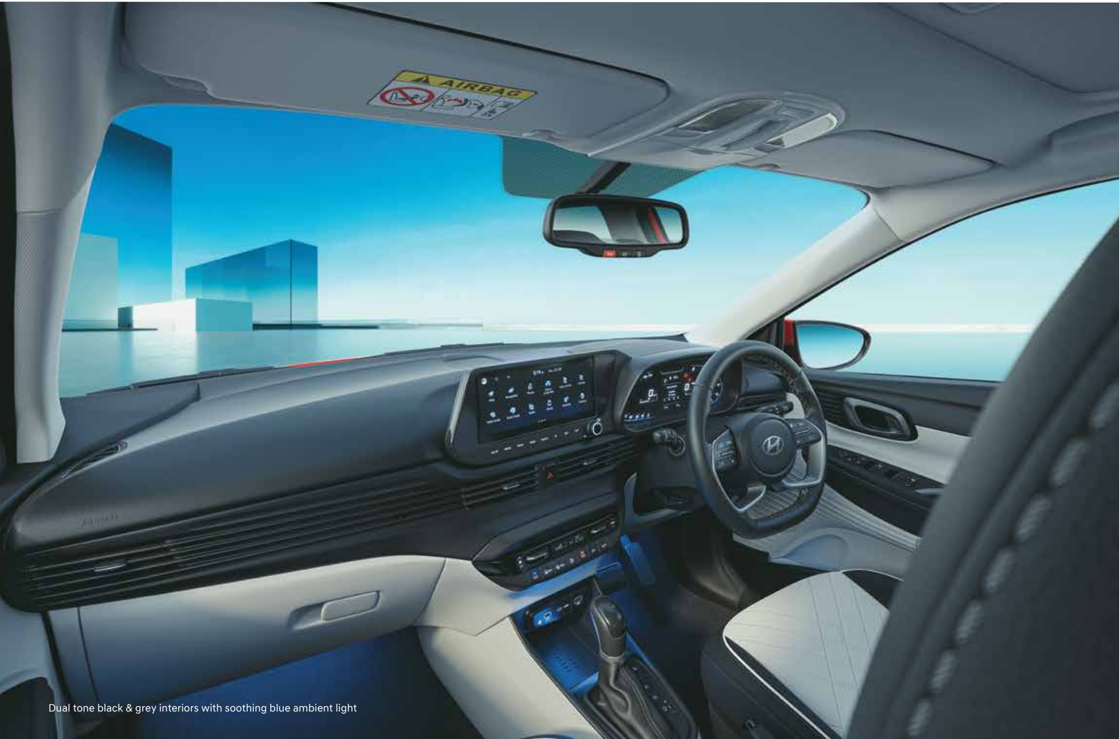
Dual tone black & grey interiors with soothing blue ambient light