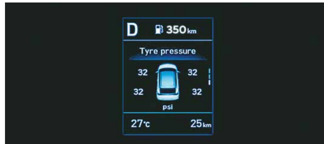
Tyre pressure monitoring system (highline) with display on MID