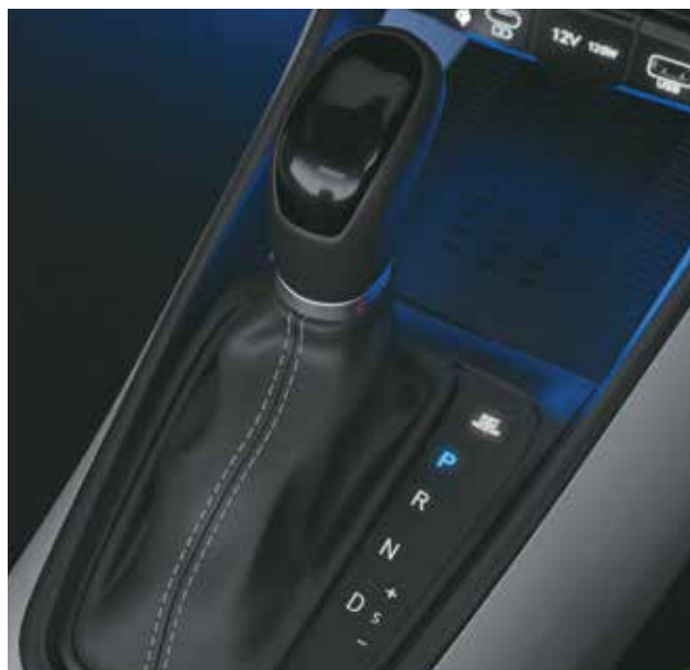
Intelligent variable transmission (IVT)