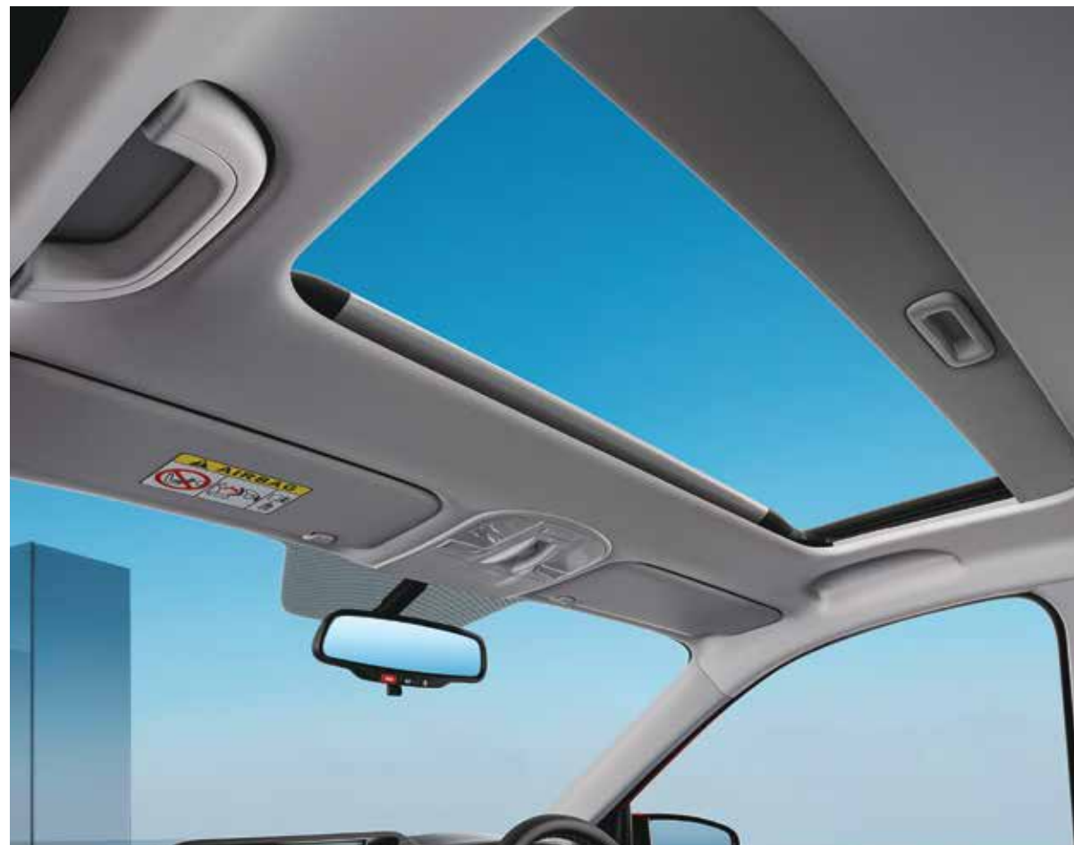
Voice enabled smart electric sunroof