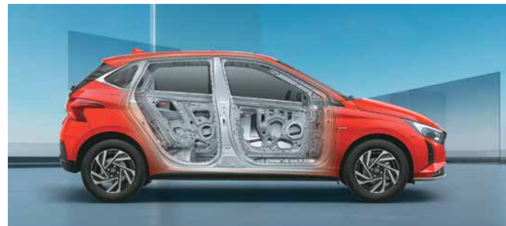
Strong body structure (with AHSS and HSS)