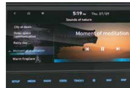
Ambient sound of nature (7 nos.)