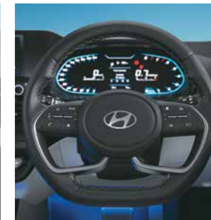
Leather wrapped D-cut steering