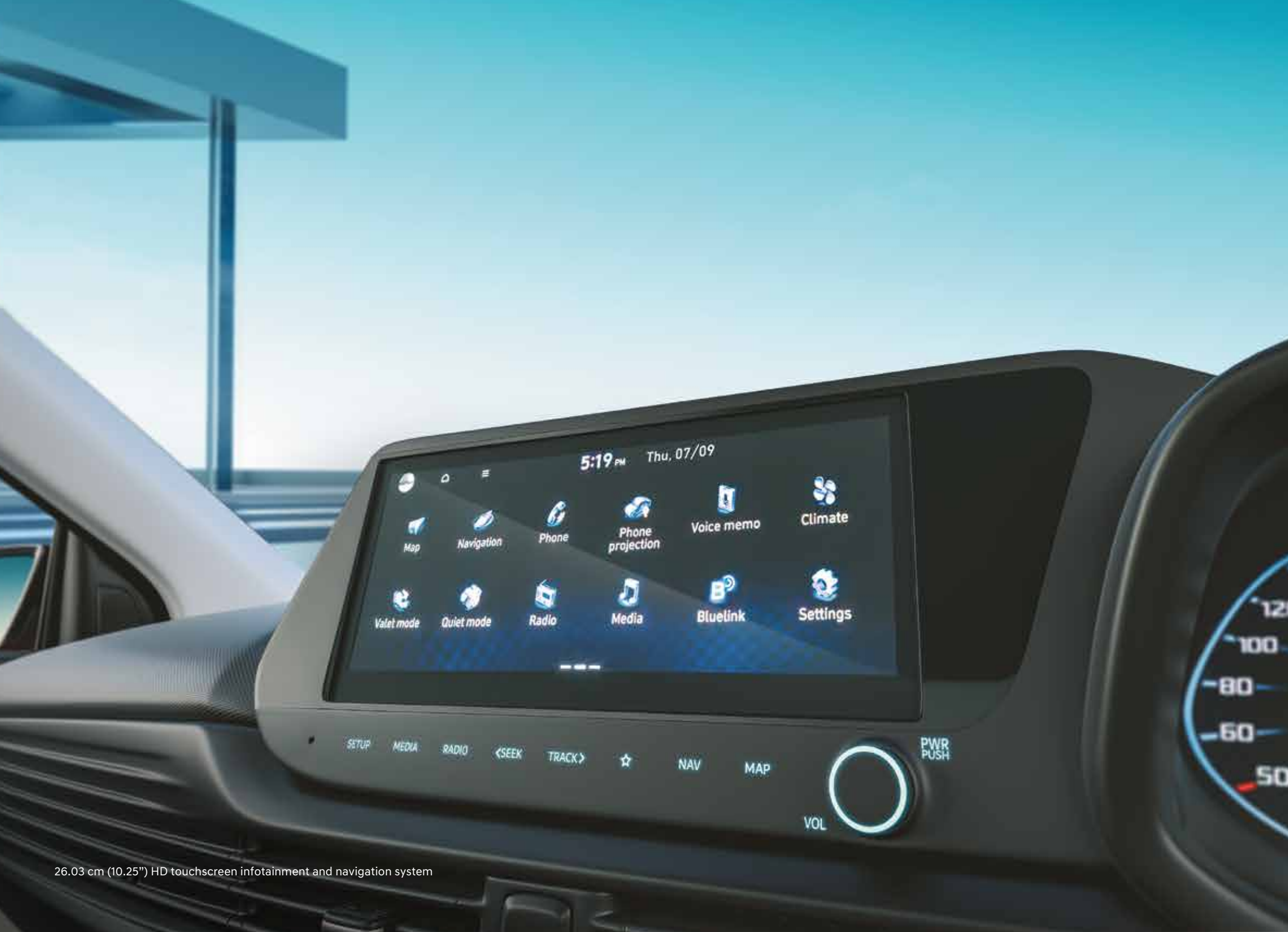
26.03 cm (10.25") HD touchscreen infotainment and navigation system