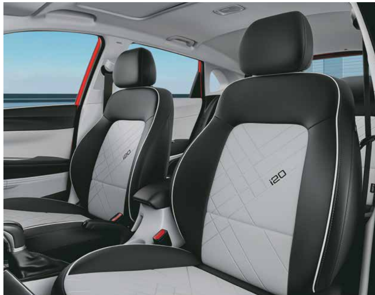
Dual tone seats with i20 branding

The interiors of the new Hyundai i20 mesmerize. Dual tone seats that look fabulous and enough space to lounge out in comfort. Ambient lighting that uplifts your mood and sliding front armrest that provides a more convenient way to relax.