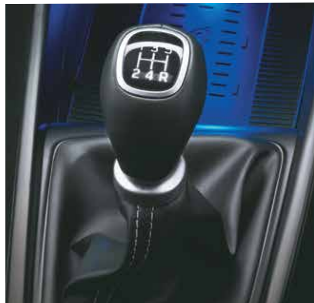
5 speed manual transmission